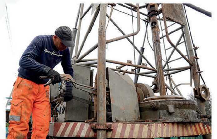
Drilling of a well