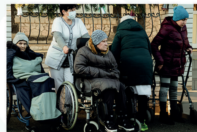
Distribution of wheelchairs