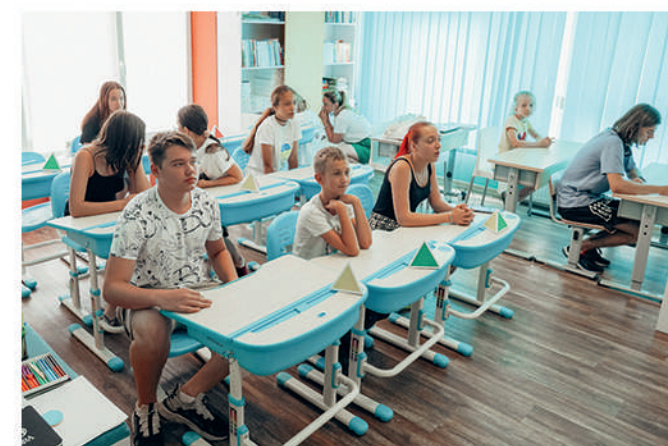
Group sessions with a psychologist