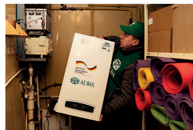
Installation of the heating system