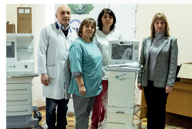
Distribution of medical equipment