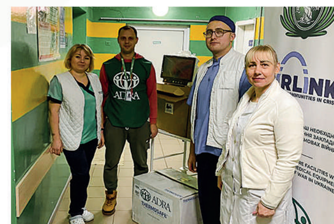
Distribution of medical equipment