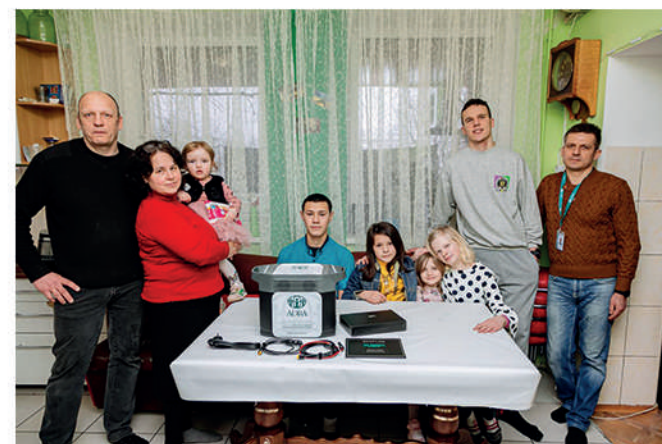
Household that received a power bank