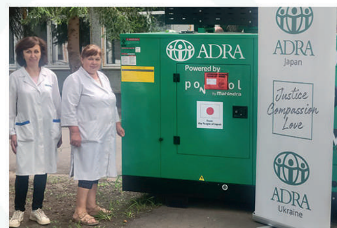
Generators for a medical institution