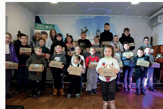
Gifts for children