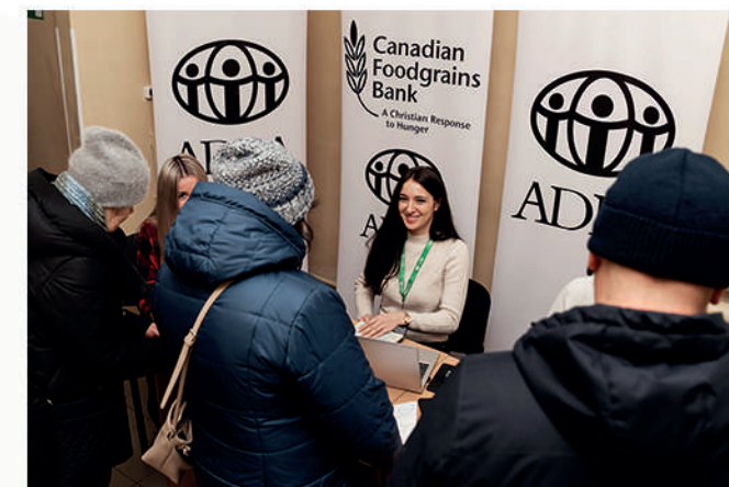
Offline cash assistance registration