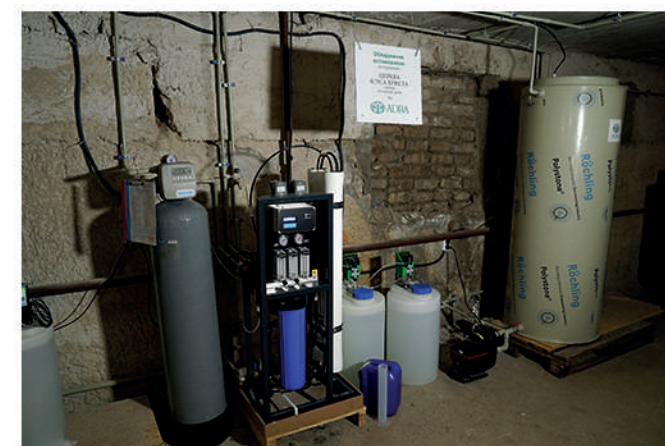
Installation of a water purification system