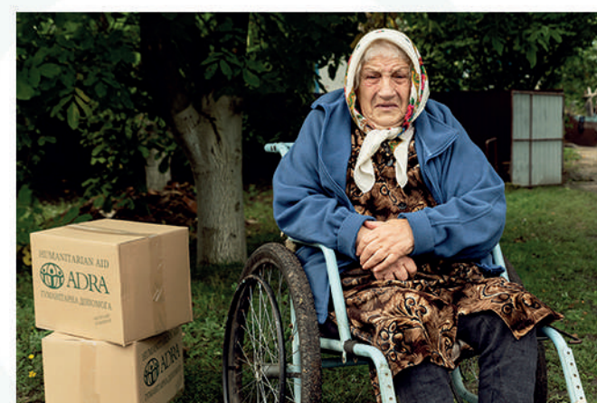
Distribution of food kits