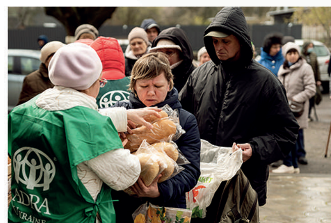
Distribution of bread