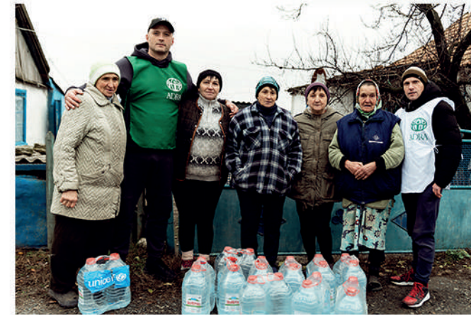
Distribution of bottled water