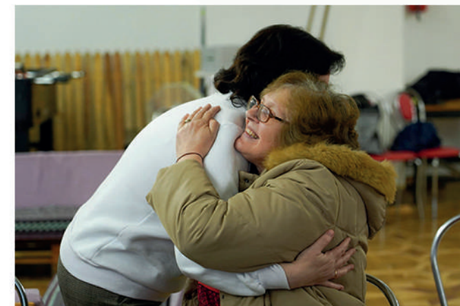
Psychosocial support for PWD