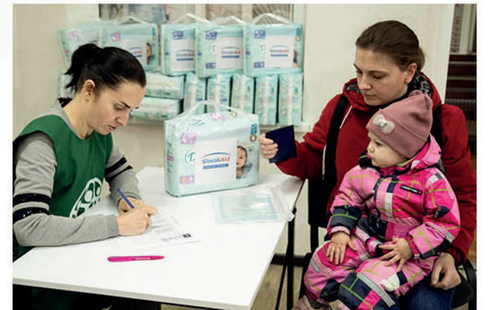
Distribution of hygiene kits