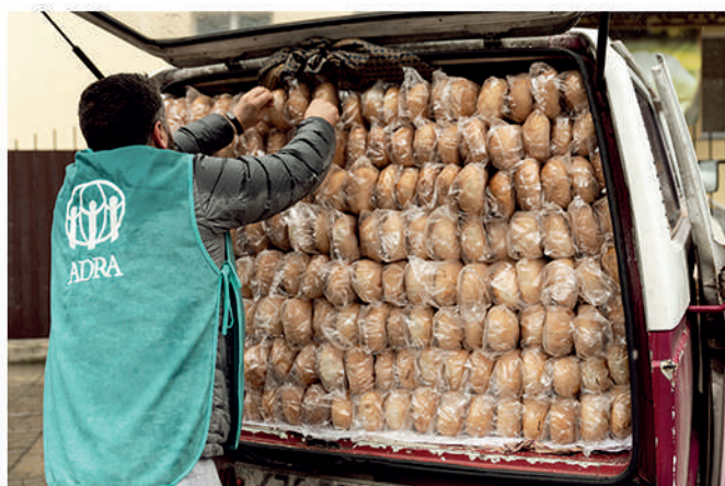
Distribution of bread