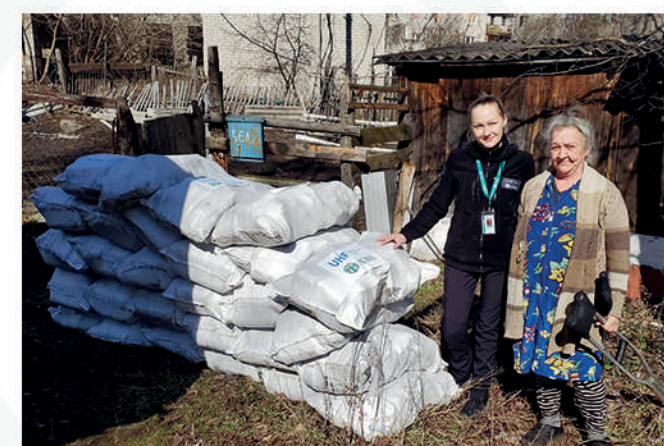
Distribution of solid fuel