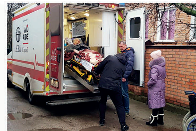
Evacuation of immobile people