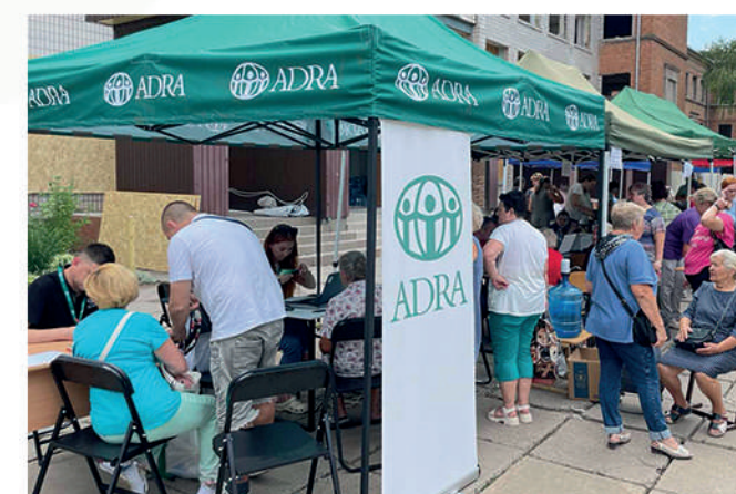
Registration after the missile attack