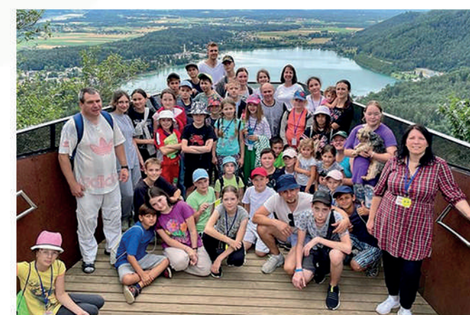
Summer camp for children