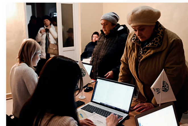
Offline cash assistance registration