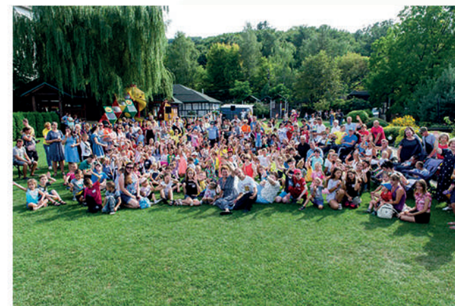
Summer camps for children