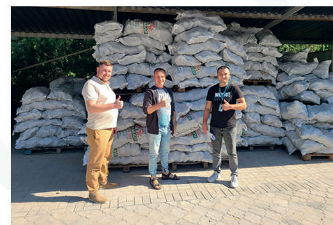
Distribution of solid fuel