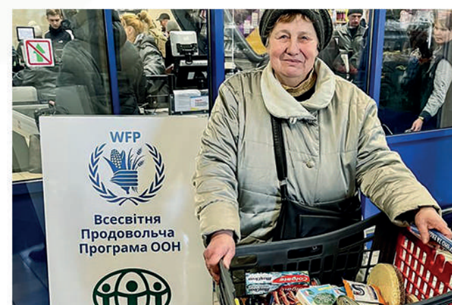
Distribution of food voucher