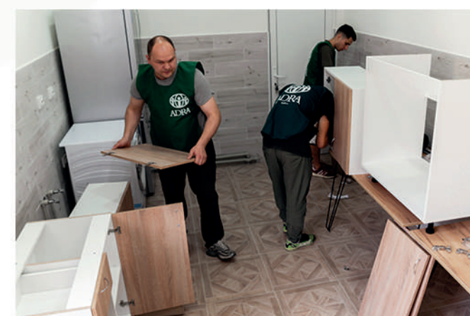
Equipment for collective center