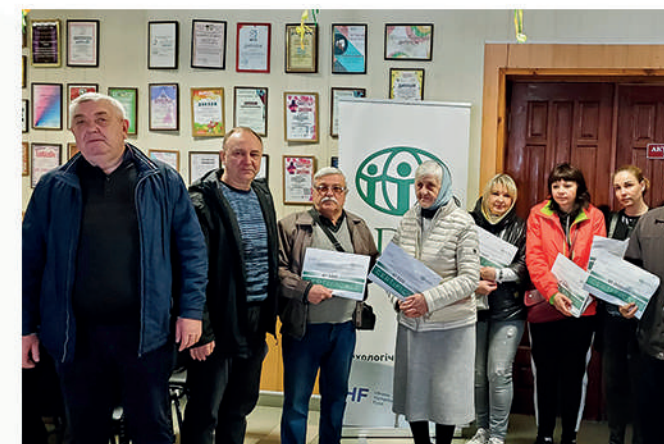
Distribution of vouchers for repairing