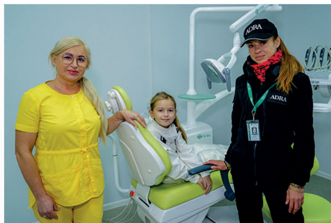
Distribution of medical devices