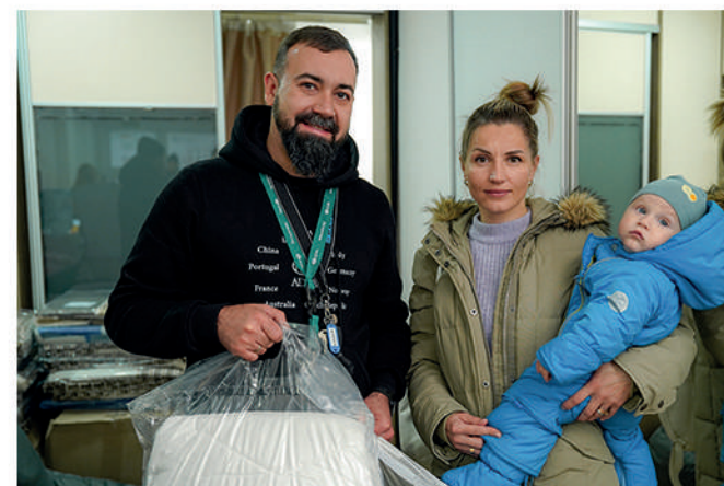
Distribution of winterization kits