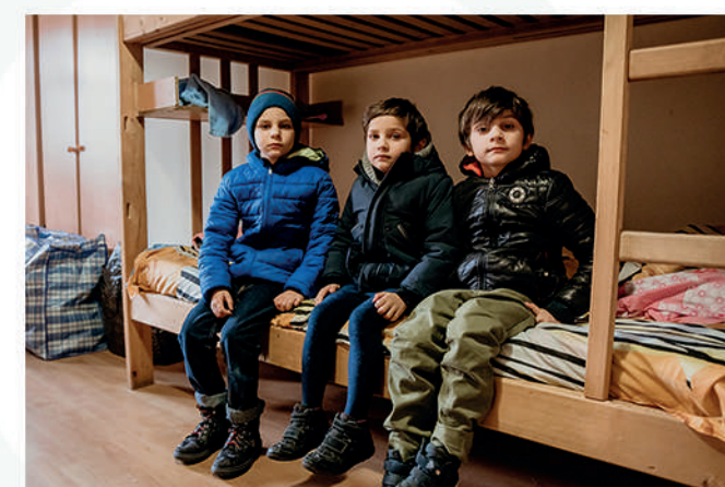
Shelter for IDPs