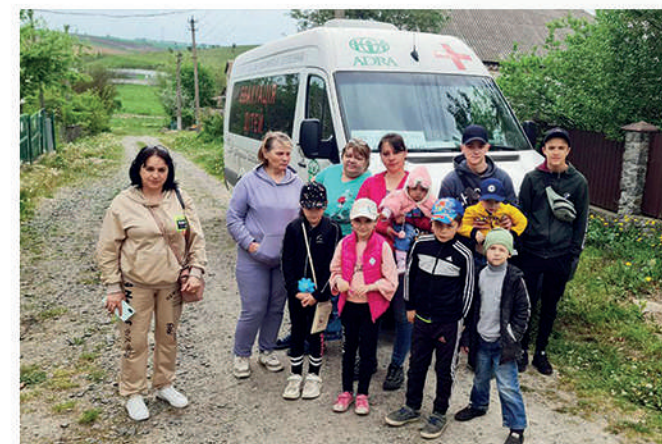
Evacuation from front lines