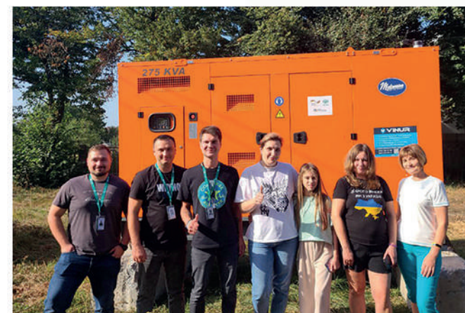
Generator for module houses