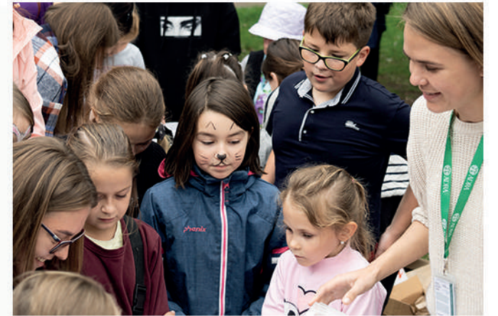
Psychosocial support for children