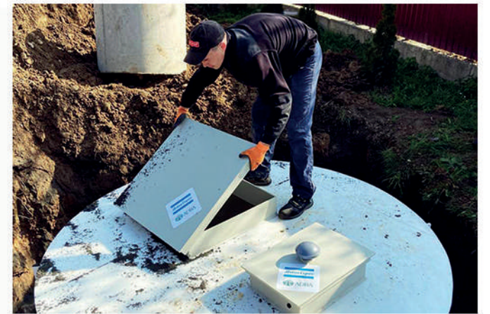
Installation of a sewer system