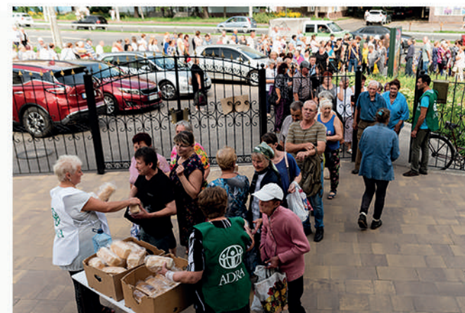
Distribution of bread