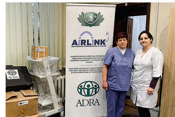
Distribution of medical equipment