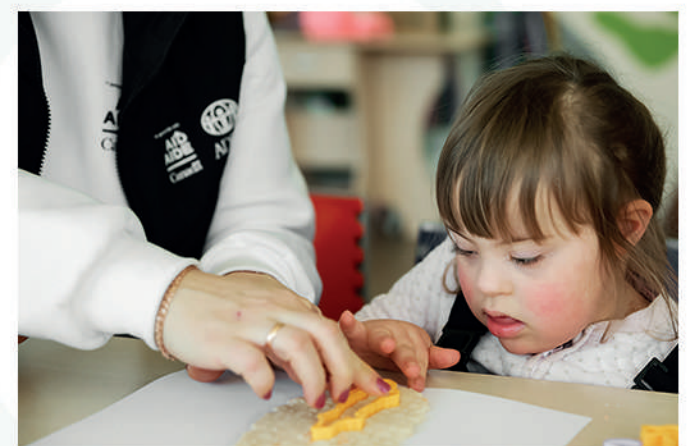
Support of children with disabilities