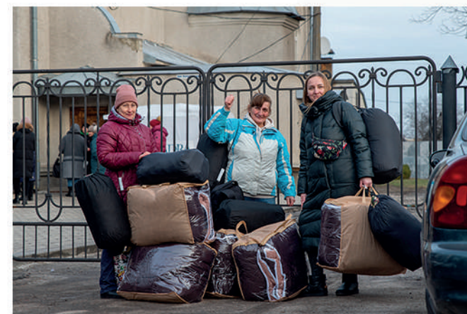
Distribution of beddings