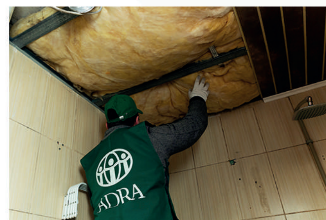
Insulation of shelter for IDPs