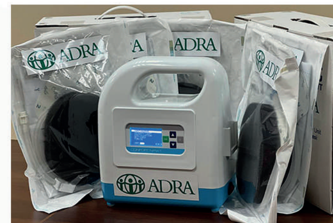
Distribution of VAC devices