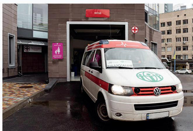
Evacuation of immobile people