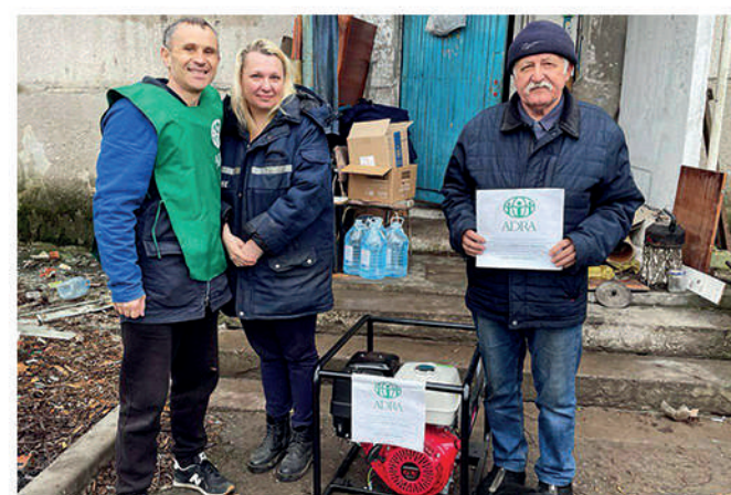
Generator for an invincibility point