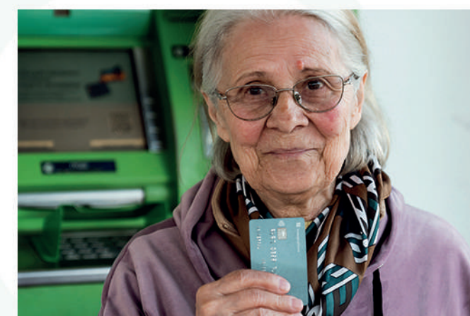
Beneficiary who has received the MPCA