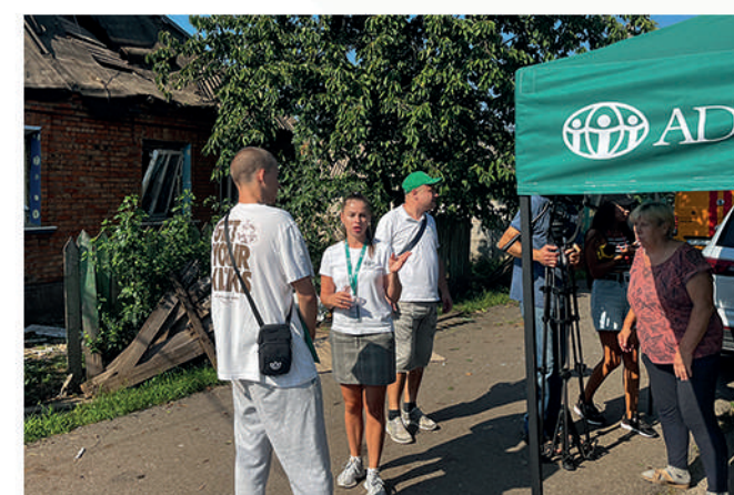
Registration after the missile attack