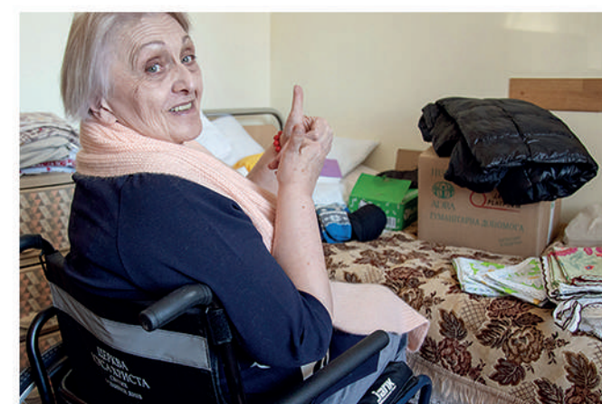
Beneficiary has received the wheelchair