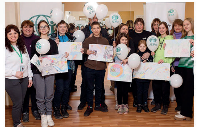
Art therapy for children