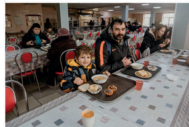
Protection center for IDPs