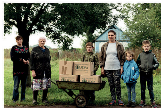
Distribution of food kits