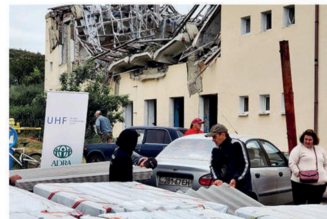
Distribution of building materials