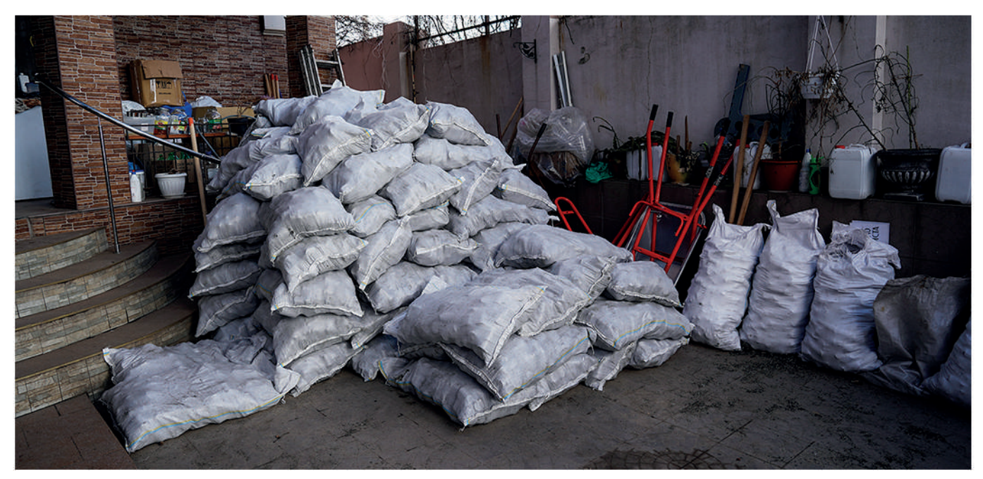
Fuel briquettes for the residents of Kherson, purchased with money, collected at the concert