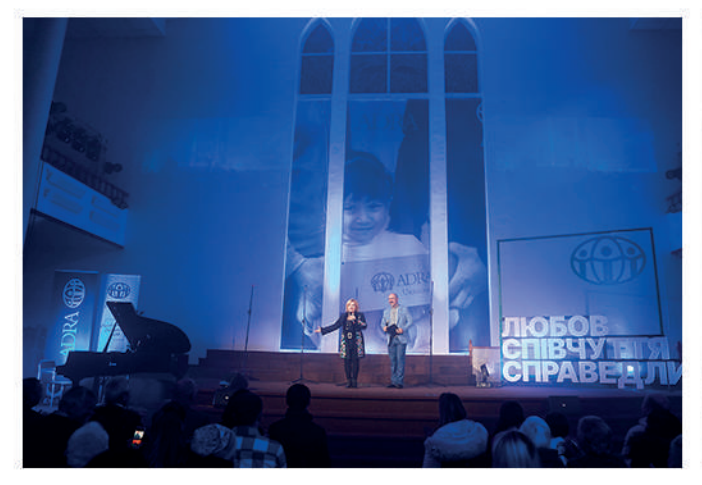
30th anniversary of ADRA Ukraine charitable concert

— They were sincerely grateful. They were pleased by the fact that the funds were raised by Ukrainians themselves, that Kherson residents could feel support of people from Kyiv and other cities. Since Kherson residents very exhausted by the constant fighting, ad any support from their fellow citizens was very important to them.