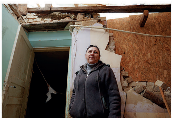
One of the residents of Kherson who received help